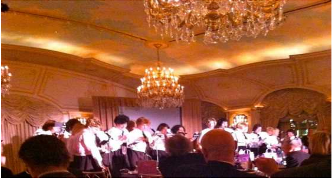
The grand finale, a parody of “I Believe” from The Book of Mormon