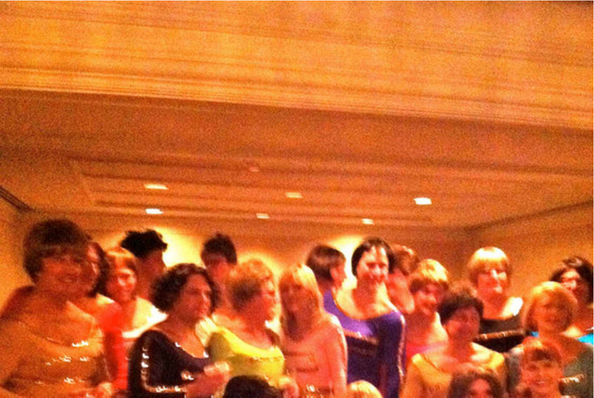
The Kappa Beta Phi neophyte class of cross-dressing billionaires.