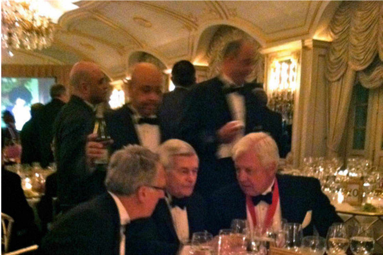
Several Kappas at the table next to me, presumably discussing the coming plutocracy.