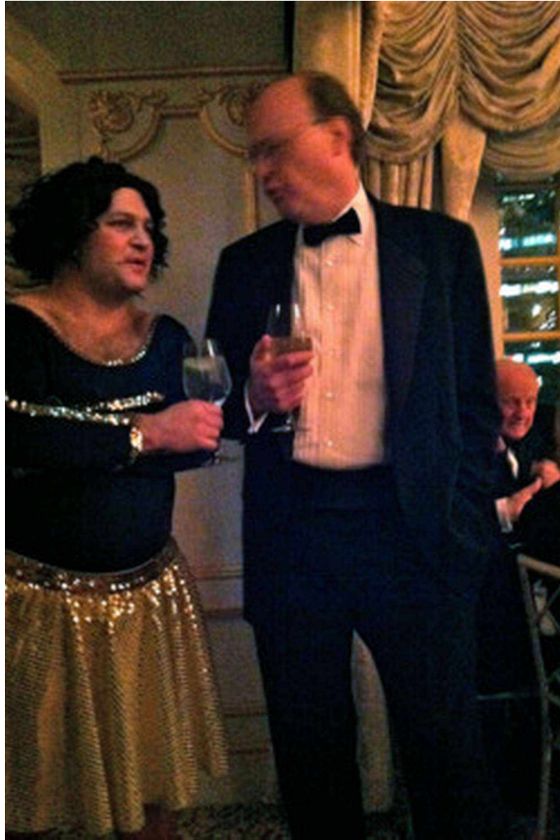
A typical Kappa neophyte in drag (left) chats up a vet. This explains much about why the Biden and Silicon Valley Administration's love the whole “transgender” thing