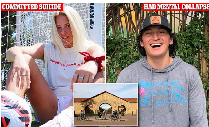
Investigation exposes Stanford hounding undergrads to suicide