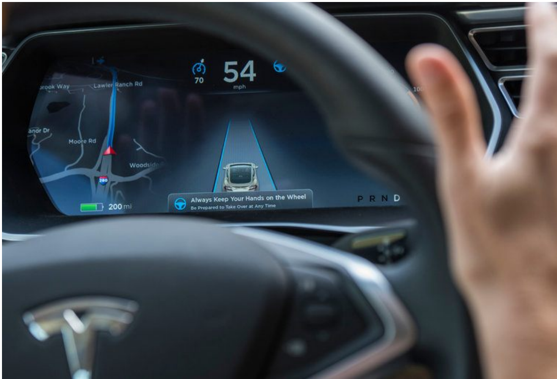
The dashboard of a Model S equipped with Autopilot, Tesla's autonomous driving system.

Federal highway safety officials, deepening their investigation of Tesla Motors and the company's Autopilot technology, have asked a set of detailed questions about the company's crash-prevention systems and any incidents in which they failed to work properly, including the fatal May 7 accident that sparked the inquiry.