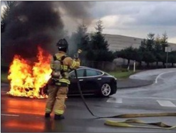
TESLA BATTERIES EXPLODE INTO FLAMES ON PUBLIC ROAD