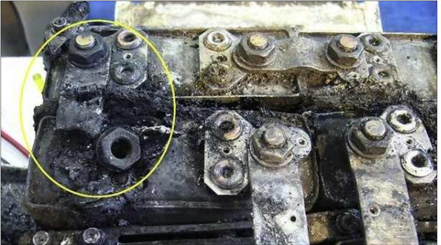
HERE IS THE BATTERY YOU COULD HAVE BEEN SITTING ON TOP OF IN A TESLA