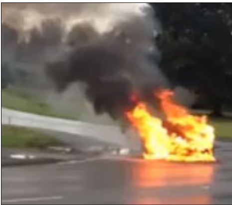
TESLA BATTERIES EXPLODE INTO FLAMES ON PUBLIC ROAD