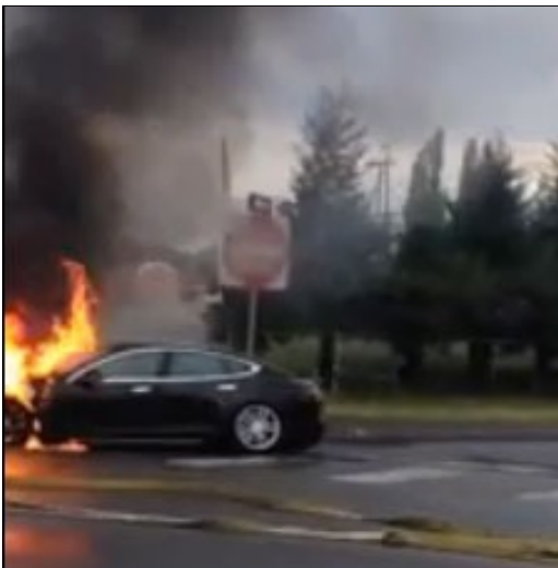
TESLA BATTERIES EXPLODE INTO FLAMES ON PUBLIC ROAD

Look at this: We were just sent a link that our website showed up in this movie: