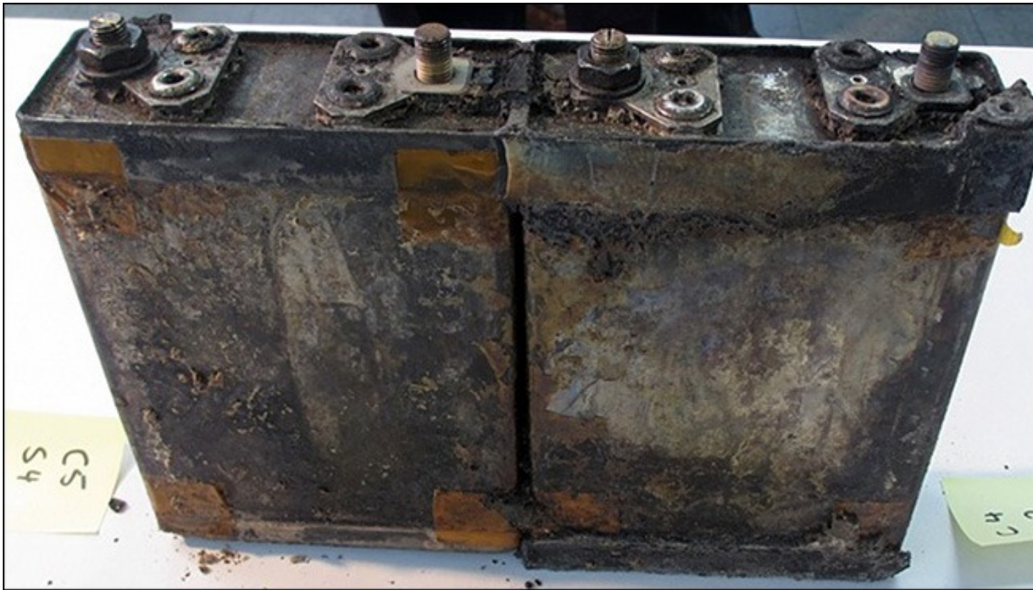
THIS IS AN ACTUAL BOEING BATTERY