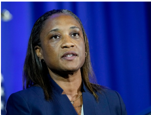
Laphonza Butler, President of EMLY's List, speaks during an event in Washington on Friday, June 23, 2023.

Newsom appointed EMLY's List President Laphonza Butler to fill the Senate seat on Monday to keep with his previous promise of nominating a black woman. Butler also has the added benefit of being the first LGBTQ member to represent the state of California in the U.S. Senate. However, immediately after news of her appointment broke, Republicans across social media noted that she listed the state of Maryland as her residence, forcing her to scrub her public bios. Newsom also had to backtrack on his previous promise to appoint a "caretaker" to fill the seat so that the current Democrat primary could go forward without interruption.