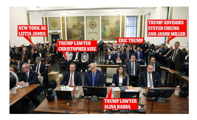
Trump to appear in court today in $250M New York civil fraud trial