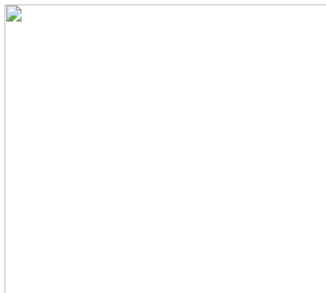
The Silicon Valley Cartel

Additional cases are planned for filing. Formal complaints have been filed with The SEC, The DOJ, The GAO, The FBI, The FTC and The U.S. Congress. Active investigations into ' Angelgate ' and related collusion and anti-trust matters are known to be under-way by federal, news outlet and private investigators as of 2020.