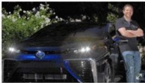
A man stands next to a hydrogen fuel cell vehicle at night. The car is the only one of its kind in the U.S.

But even hydrogen's most ardent proponents agree the technology faces enormous hurdles. Like electric cars, hydrogen fuel cell vehicles are expensive. So is the infrastructure to refuel them.