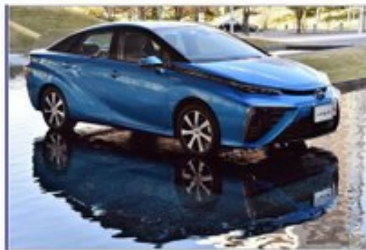
Japanese auto giant Toyota Motor's hydrogen fuel-cell vehicle Mirai is displayed in Tokyo in November 2014.

While most competitors are focusing on hybrids, with a heavy emphasis on battery-based models, Toyota remains skeptical about the long-term role of electric vehicle technology.