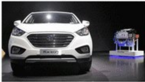
Hydrogen fuel cell vehicle on display at a Toyota car show in Los Angeles. The car is the only one of its kind in the U.S.

BY CHARLES FLEMING assistant managing editor