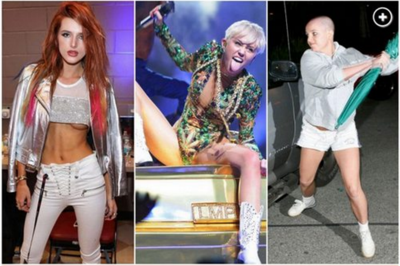
Bella Thorne, Miley Cyrus in 2014 and Britney Spears in 2007.