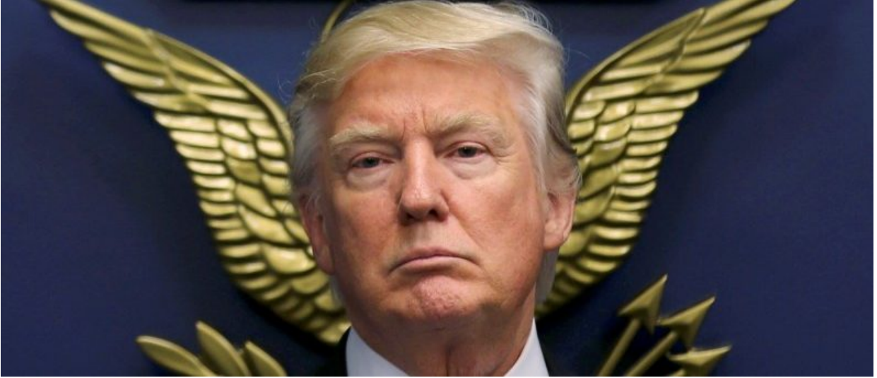
President Donald Trump looks on following a swearing-in ceremony for Defense Secretary James Mattis at the Pentagon in Washington, January 27, 2017.